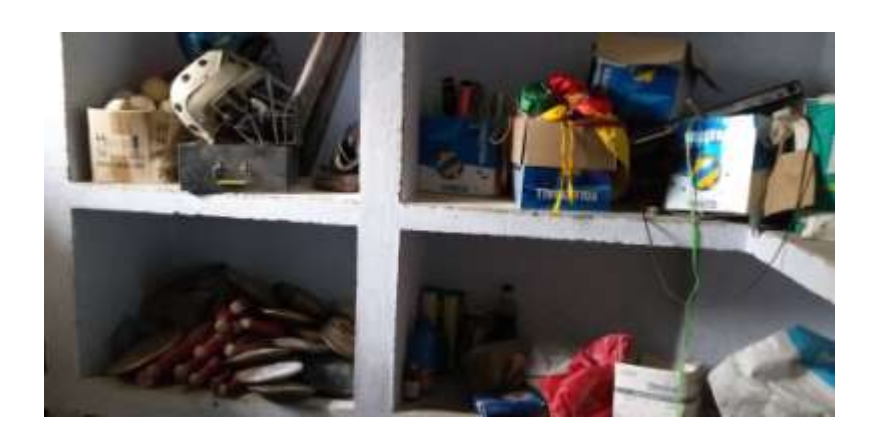
Fig. 5 – Sports Equipment

College permits local citizen and children to actively participate in gymnasium. In our college, gymnasium constructed a bridge of social relationship among teaching staff, non-teaching staff, students, local citizen etc.