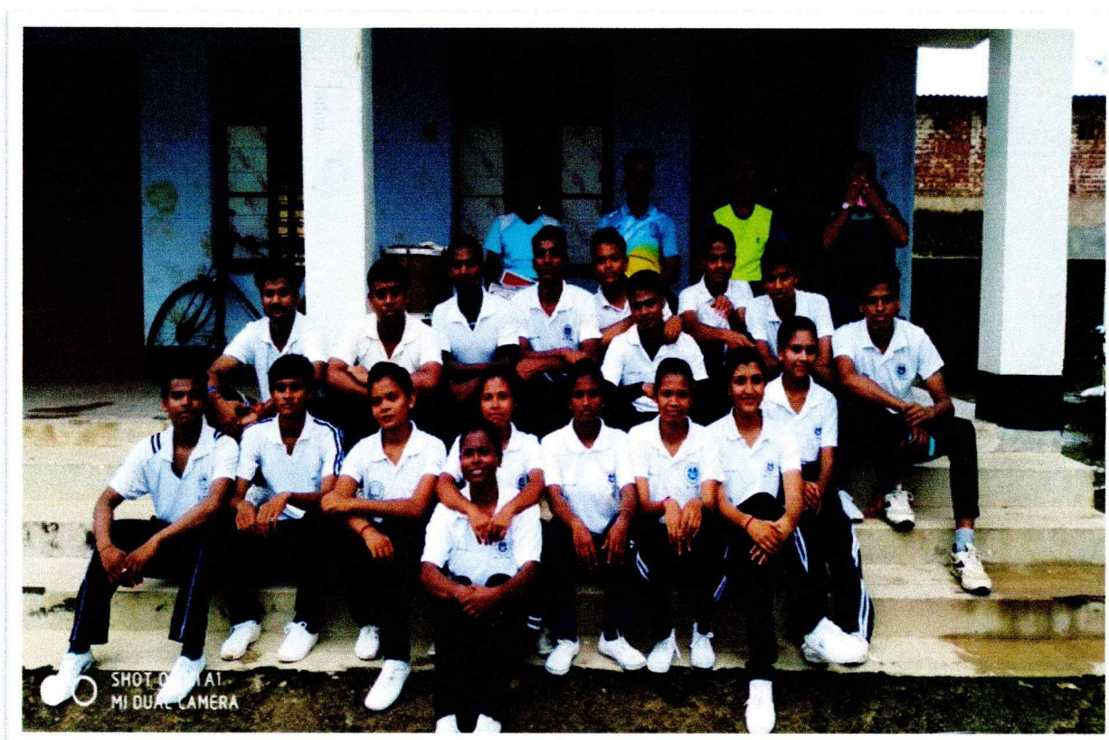
Students: After the Practical Class