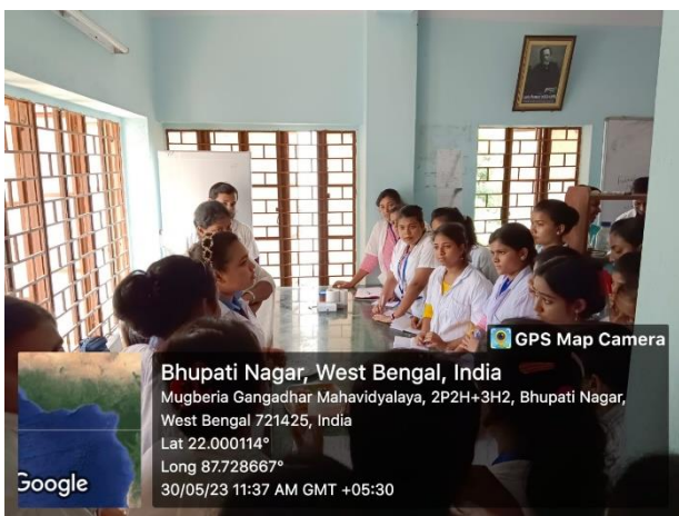
Bhupati Nagar, West Bengal, India Mugberia Gangadhar Mahavidyalaya, 2P2H+3H2, Bhupati Nagar, West Bengal 721425, India Lat 22.000114° Long 87.728667° 30/05/23 11:37 AM GMT +05:30