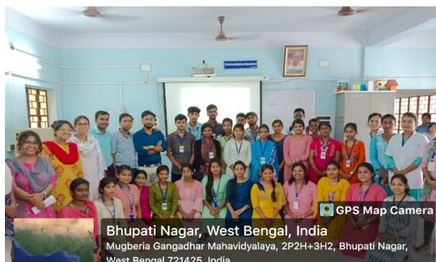
Bhupati Nagar, West Bengal, India Mugberia Gangadhar Mahavidyalaya, 2P2H+3H2, Bhupati Nagar, West Bengal 721425, India