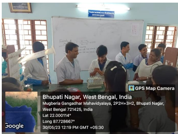
Bhupati Nagar, West Bengal, India Mugberia Gangadhar Mahavidyalaya, 2P2H+3H2, Bhupati Nagar, West Bengal 721425, India Lat 22.000114° Long 87.728667° 30/05/23 12:19 PM GMT +05:30