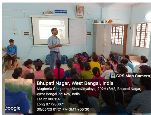
Bhupati Nagar, West Bengal, India Mugberia Gangadhar Mahavidyalaya, 2P2H+3H2, Bhupati Nagar, West Bengal 721425, India Lat 22.000114° Long 87.728667° 30/05/23 01:21 PM GMT +05:30